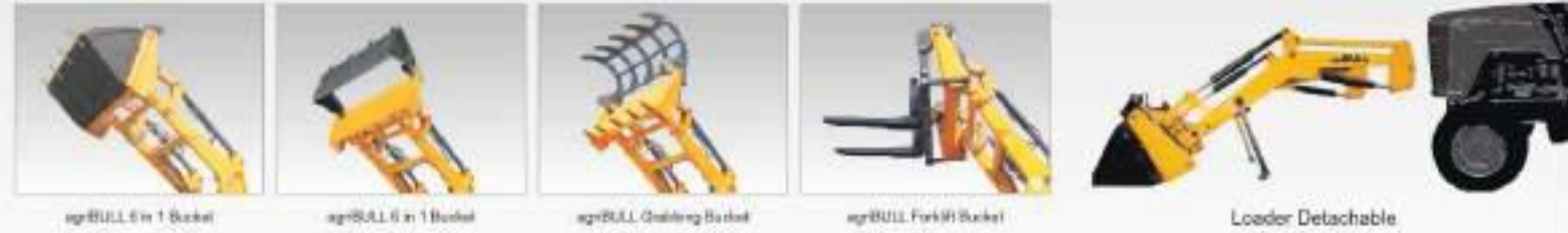
agriBULL 6 in 1 Bucket