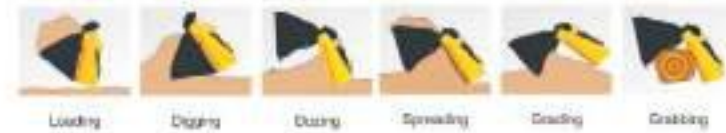
Loading Digging Dipping Spreading Grading Grabbing

*Design/Patent protected by Intellectual Property Law